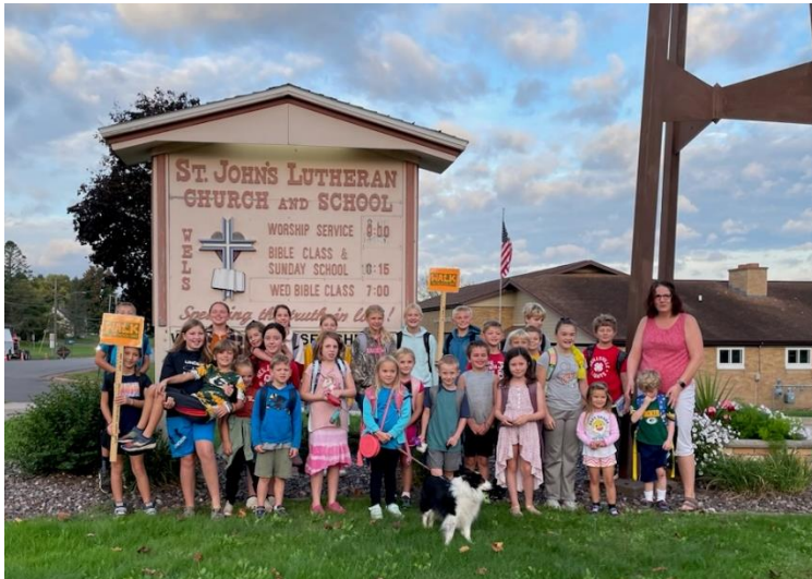
St. John's Walk to School Crew

Walk to School: We thank all who participated in Walk To School Day this past Wednesday. We especially thank our parent chaperones.